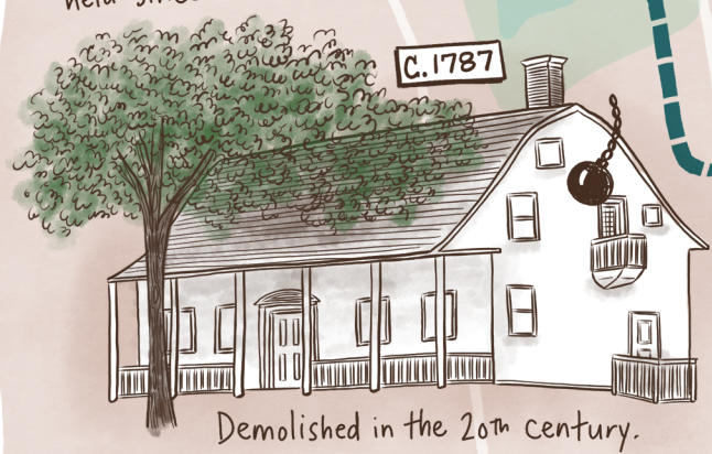
C.1787 Demolished in the 20 th century.